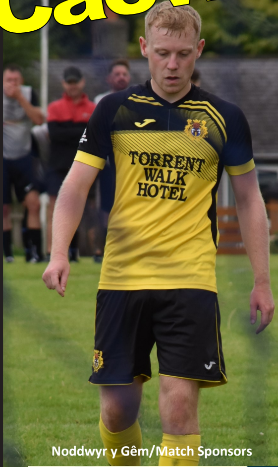
Noddwyr y Gêm/Match Sponsors

Rhaglen Swyddogol-Official Programme CPD DOLGELLAU AAFC