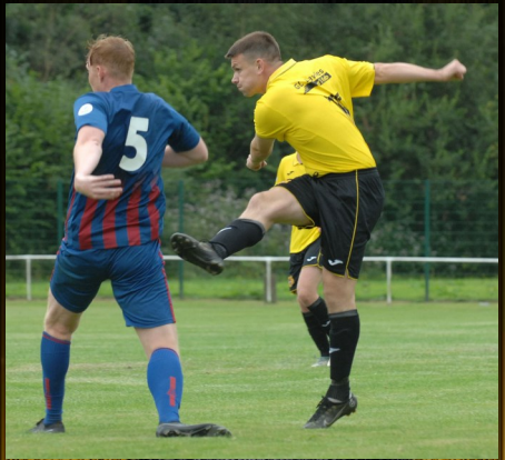
Dolgellau 3 v 4 Llangollen Town It was quite a game! Some of Rod Davies Photography's excellent shots form Saturday's encounter against top of the league side Llangollen Town.